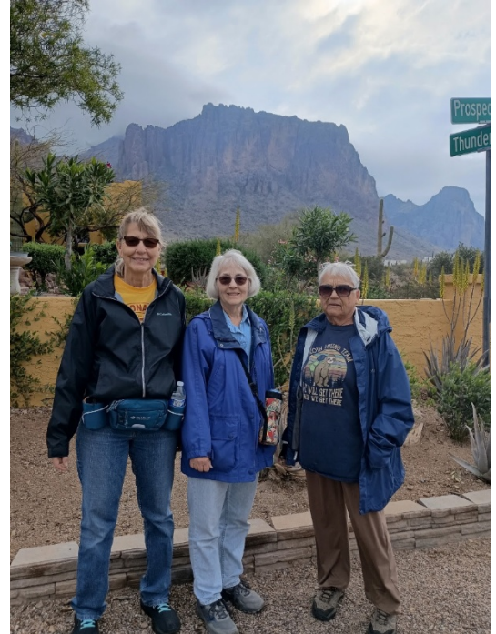
Two recent hikes taken by the Trekking on Tuesday group - note the new name!!