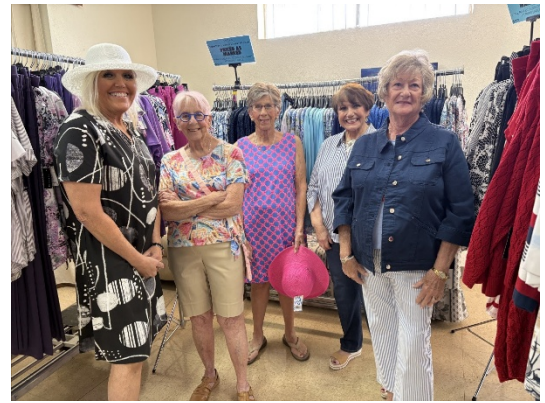
A wonderful time was had by all at this year's ECW Spring Luncheon & Style Show this past Saturday.