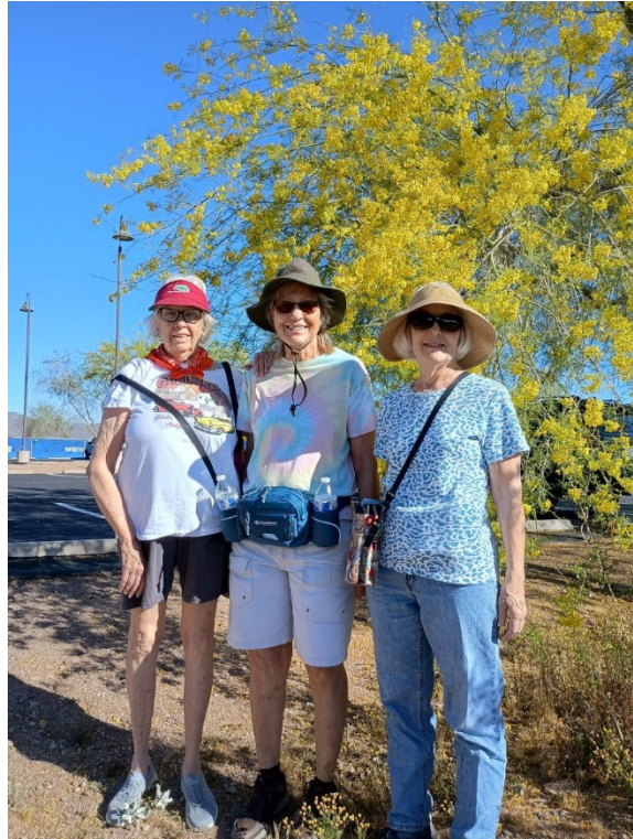
The Trekking on Tuesday group enjoyed an early walk this week in order to beat the heat!! Notice the gorgeous blooming Palo Verde tree in the background!