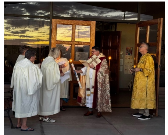
Photos from Holy Week services.