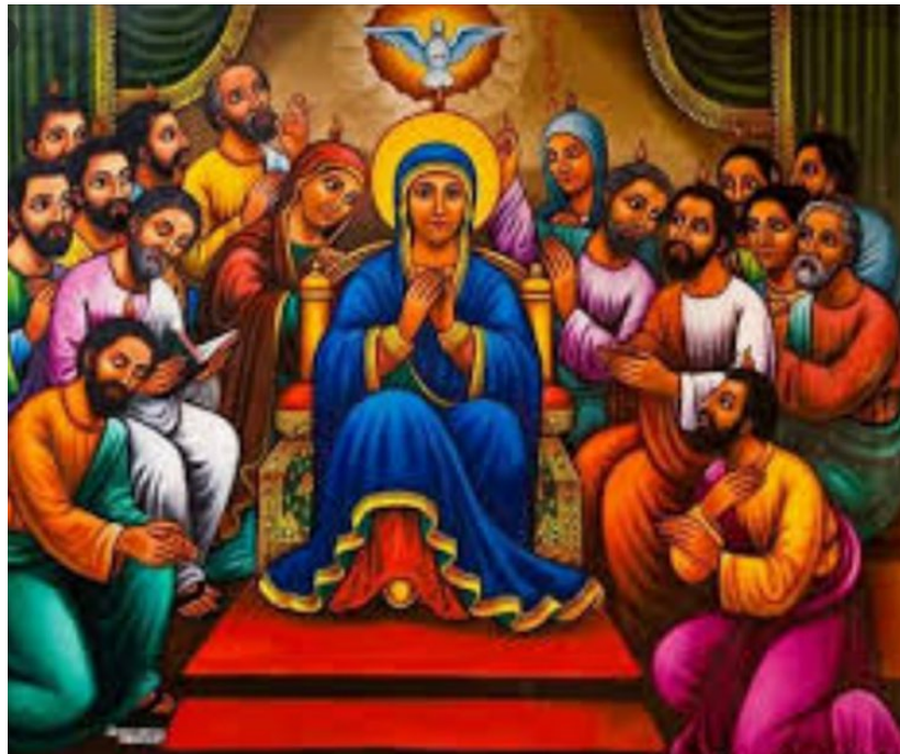
Ethiopian Orthodox Icon: The Day of Pentecost